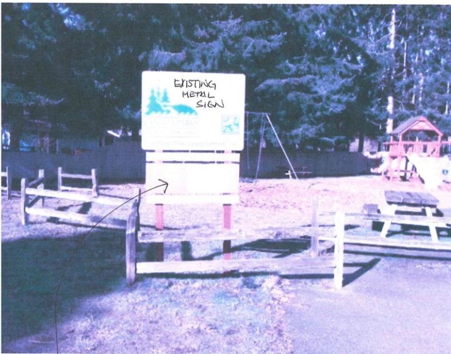
PROPOSED REPLACEMENT WOODEN SIGN IN A LOWER POSITION, AT THE SAME LOCATION.