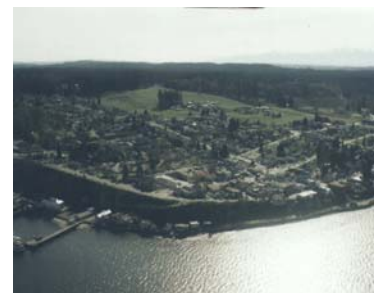
City of Langley