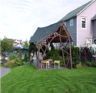
2nd Street Park

If you have any questions or concerns regarding the City's water utility, your water, or this report, please contact the Public Works Department. In a water emergency, please call 911.