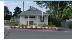
South Whidbey Historical

The table below lists all the drinking water contaminants that we detected during the 2010 calendar year. The presence of these contaminants does not necessarily indicate that the water poses a health risk. Unless otherwise noted, the data presented in this table is from testing done January 1 through December 31, 2010. The state requires us to monitor for certain contaminants less than once per year because the concentrations of these contaminants are not expected to vary significantly from year to year. Some of the data, though representative of the water quality, is more than one year old.